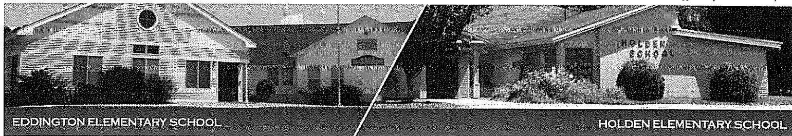
440 Main Road | Eddington, ME 04428 | P: 207-843-6010 | F: 207-843-4317